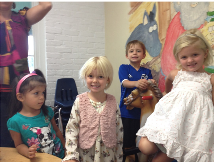
Sunday School—Pre K Class