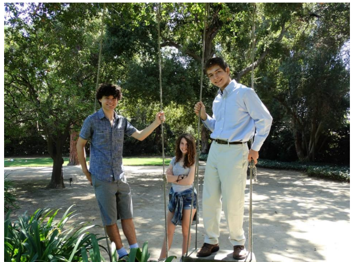
A Good Time Was Had by all!!